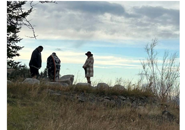
A view from the Living Spaces property on Coldwater Drive.